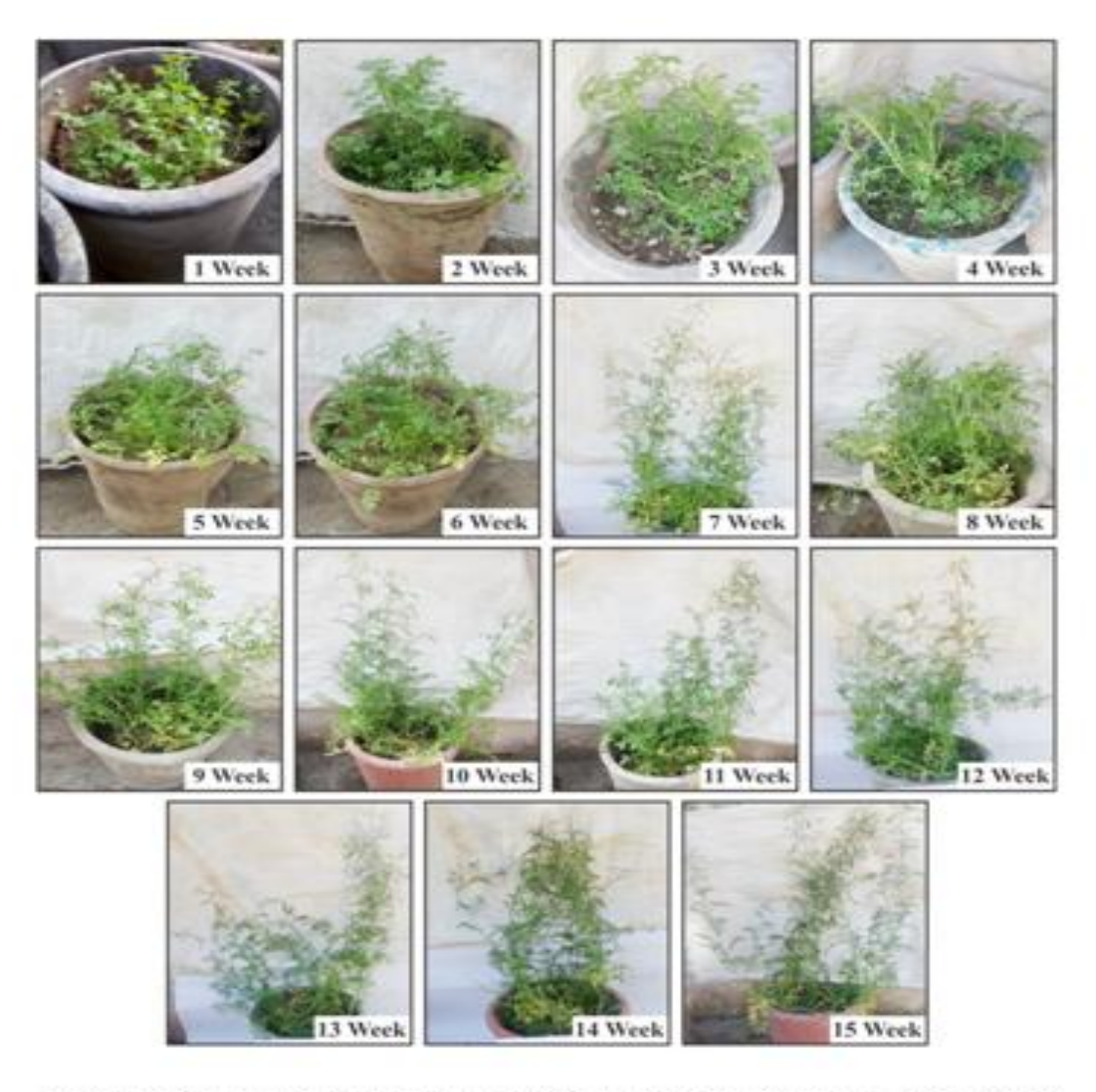
Plate 4: Epidemological evaluation of different weather parameters with disease development of Alternaria leaf spot on pot grown Asalio plants

In 7th week of observations it increased to 114.73. In 8th to 12th weeks after inoculation due to dry spell with moderate in temperature and increase in relative humidity, there was an abrupt increase in AUDPC range from 114.73 - 442.58. Followed by 13th to 15th weeks after inoculation the AUDPC was observed to be constantly increasing ranging from 483.39 - 507.54, reaching to its maximum (Table – 3 and Fig- 3). The results show that the disease development had three